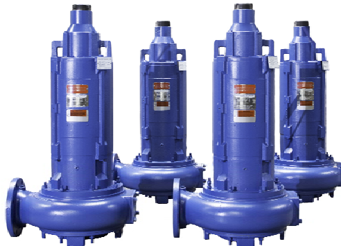
Submersible Double Seal