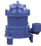
Submersible Single Seal