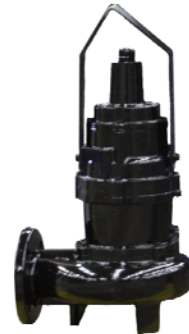
Submersible Single Seal Black Epoxy