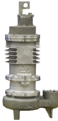
Stainless Steel Submersible Double Seal