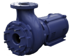
Dry Well Pump